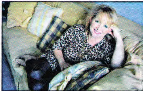
NEW LOOK: A slimline Cheryl Baker at her home near Ightham.

They are planning to buy a new home nearer to Sevenoaks town centre.