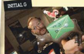
INITIAL G G: "I was running around like a horseless chicken."