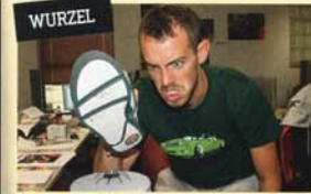
WURZEL Wurzel: "My girlfriend had a dream about a Spoodle. It was spider with fluffy poodle legs."