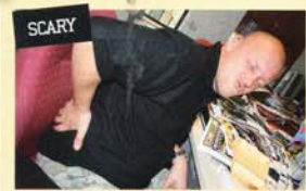
SCARY Scary: "I've just done my back in havin' a shit."

NOT SO MUCH COMICAL. MISUNDERSTANDINGS AS ADMISSIONS OF DEVIANCY WE WISH WE COULD TAKE BACK.