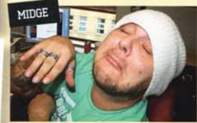
MIDGE Jules: "I'm playing table tennis tonight." Midge: "You mean gay-ble tennis?" Jules: "There's nothing gay about table tennis."