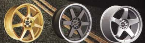
RD21 17x7.0, 18x7.5 ST16 16x6.5, 17x7.0, 18x7.5 ST15 18x8.0, 18x9.5